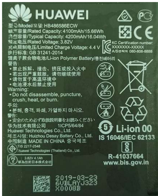
电池组铭牌 Battery Nameplate