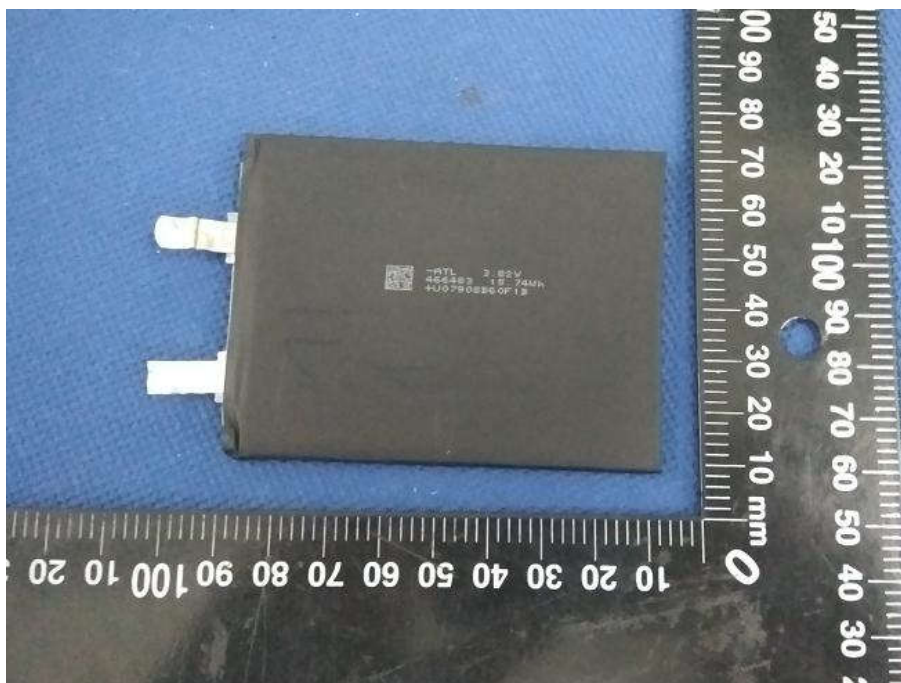
元件电池 Component cell