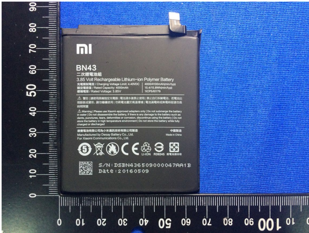
Battery (BN43 3,85V 4000mAh/15,4Wh(Min) 4100mAh/15,8Wh(Typ))