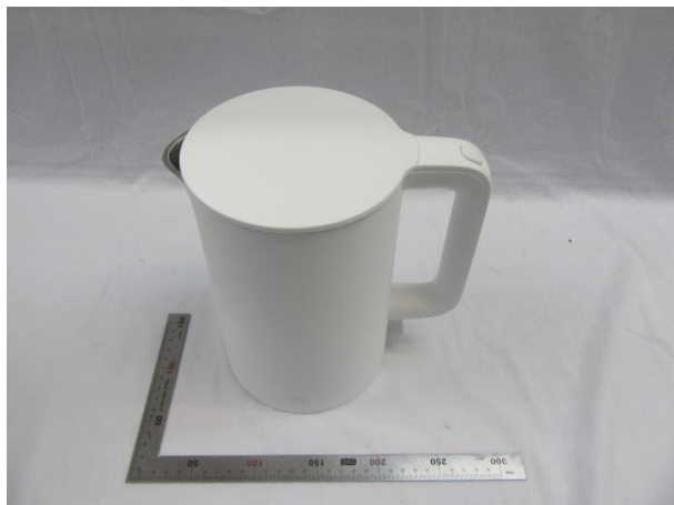
Sample No. 1