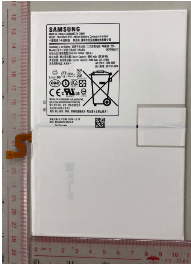
Battery/电池 (EB-BT725ABU 3,85V 6840mAh 26,34Wh)